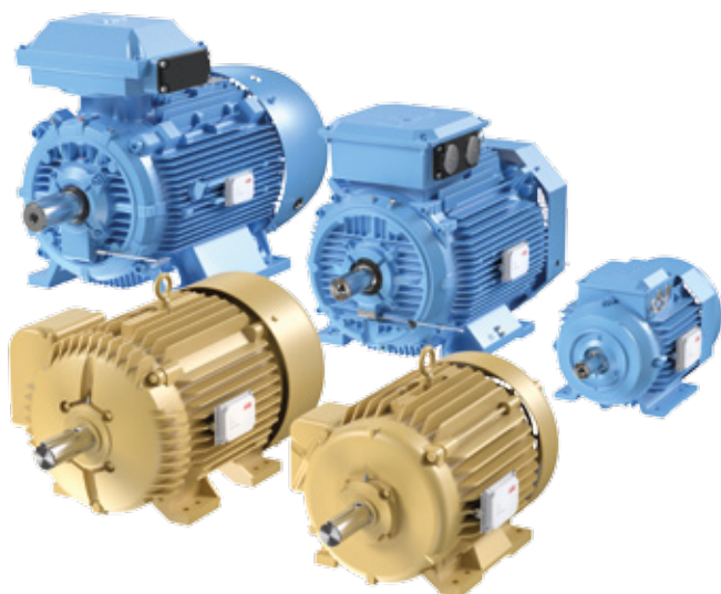
ABB Ability™ Smart Sensor Condition monitoring for motors

The ABB Ability™ Smart Sensor converts traditional motors into smart, wirelessly connected devices. It enables users to monitor the health of their motors and to plan maintenance in advance. Unplanned downtime can be avoided, efficiency optimized and safety improved.