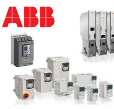
ABB SOFTSTARTERS, VARIABLE SPEED DRIVES FOR HVAC, GENERAL MACHINERY, DC APPLICATIONS

We offer wide range of load break switches included enclosed load break switches, manual/motorised changeover switches, AC/DC AF contactors, thermal overload relays, pilot devices such as push buttons, selector switch, manual motor starter such as MS116 and MS132 series, Electronic timers, plug in relays and terminal blocks that are used in most control panels etc.