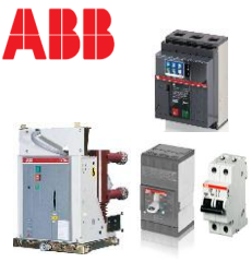
ABB RCCBs, MCBs, MCCBs, ACBs & VCBs

We offer wide range of circuit breakers range from residential, commercial and Industrial Circuit breakers such as SH200, S200,S800 series etc. ABB MCCBs includes FORMULA, TMAX XT and TMAX range. Air Circuit Breakers such as VD4 is also part of our offering. We partner will ABB to provide installation, testing and commission for breakers that require specific technical knowledge.