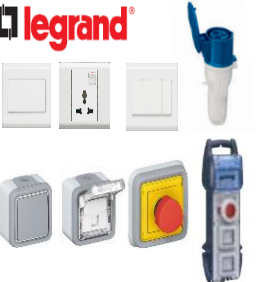
Legrand Belanko, Plexo IP 55, P17 Tempra Industrial plugs and sockets

Versatility makes Arteor the ideal choice for any project, anywhere in the world. Stunning finishes and desirable materials position the range at the forefront of design, with virtually limitless functionality making it the ultimate range for residential and commercial projects. Let the plateful of new Mallia colours delight your visual senses. With our enhanced selection of classic matt white, contemporary silver, lustrous pearl, supple copper, muscular bronze, mysterious dark sliver, melodic brass, sexy matt black, there is a colour for every style.