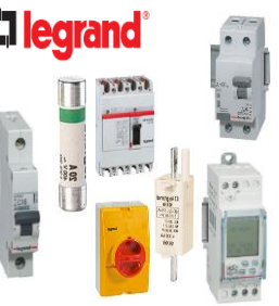
The RX³ and DX-E Circuit Breakers, DRX and DPX MCCBs, ACBs, fuses, time switches, contactors

With Belanko, switches perform exactly the way you expect them to. Beyond performance, we give you a choice between large rocker and the conventional small one. Plexo IP 55 is evolving for you. Many new functions are being added to Plexo range to satisfy all configurations, whatever your site. In addition, all control mechanisms with an indicator light or tell-tale are supplied with their bulb for insertion. Simple and practical! P17 Tempra industrial plugs and sockets incorporate numerous benefits for optimum commissioning of installations and increased user safety, ensuring continuity of services for all environments.