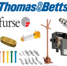
Furse, Emergi-Lite, Ty-Rap, Kopex, PMA, Adaptaflex, T&B Cabletray, Elastimold etc.

High end Residential and Hotel range switches such as Millennium and Concept BS are widely sought after in Singapore. Also, KALO is tailored as a mid range offering. Established 13A RCD 10mA/30mA socket (CRS213,CRSM213, CRS112, CRSM112 etc) has been used in key installations where safety is a key aspect. MISTRAL PVC DB boxes has enhanced the look of every housing and not just like a simple consumer units. Europe make Industrial plugs and socket range are used in DATA centers, oil and glass sectors etc.