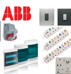
ABB Electrical Wiring Accessories such as Classic, Classic Excelsiv, KALO, Concept BS, Millennium and Industrial Plugs and sockets and designer consumer units MISTRAL

We offer the most extensive drives such as Solar pump Drives, General Purpose Drives, AC/DC drives, machinery drives. ACS150,ACS310, ACS355, ACH550, ACS550, ACS580, ACS800 and ACS880 etc. Softstarters such as PSR, PSE and PSTX range.