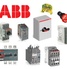
ABB LOAD BREAK SWITCHES, CHANGEOVER SWITCHES, ENCLOSED LOAD BREAK, CONTACTORS, TERMINAL BLOCKS, OVERLOAD RELAYS, MOTOR STARTERS

We offer wide range of circuit breakers range from residential, commercial and Industrial Circuit breakers such as SH200, S200,S800 series etc. ABB MCCBs includes FORMULA, TMAX XT and TMAX range. Air Circuit Breakers such as VD4 is also part of our offering. We partner will ABB to provide installation, testing and commission for breakers that require specific technical knowledge.