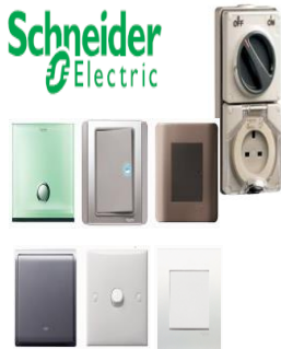
S-Classic, Vivace, Zencelo Switches, PIENO, ULTI, NEO C Metro switches and sockets,Argus Occupancy sensor, Kavacha, 56 Series

S-Classic, Vivace, Zencelo Switches, PIENO, ULTI, NEO C Metro switches and sockets boast a full spectrum of attractive colours, patterns, materials and finishes that will fit in various design concepts, match different decoration context, and actually enhance them. Switches with LED locaters give off a uniquely enticing soft glow that tells you exactly where each switch is located at night. The use of fluorescent white-on-white locaters on switches is unobtrusive by day and shines with a comforting glow in the dark. Occupancy sensors make hands-free control of lights a reality. The 56 Series is suitable for heavy industrial environments with five different protection capabilities – Hose Proof, Dust Proof, Crash Proof, UV Resistance and Chemical Resistance.