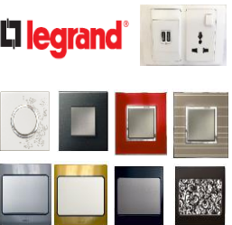
Legrand Arteor, Mallia Senses

S-Classic, Vivace, Zencelo Switches, PIENO, ULTI, NEO C Metro switches and sockets boast a full spectrum of attractive colours, patterns, materials and finishes that will fit in various design concepts, match different decoration context, and actually enhance them. Switches with LED locaters give off a uniquely enticing soft glow that tells you exactly where each switch is located at night. The use of fluorescent white-on-white locaters on switches is unobtrusive by day and shines with a comforting glow in the dark. Occupancy sensors make hands-free control of lights a reality. The 56 Series is suitable for heavy industrial environments with five different protection capabilities – Hose Proof, Dust Proof, Crash Proof, UV Resistance and Chemical Resistance.